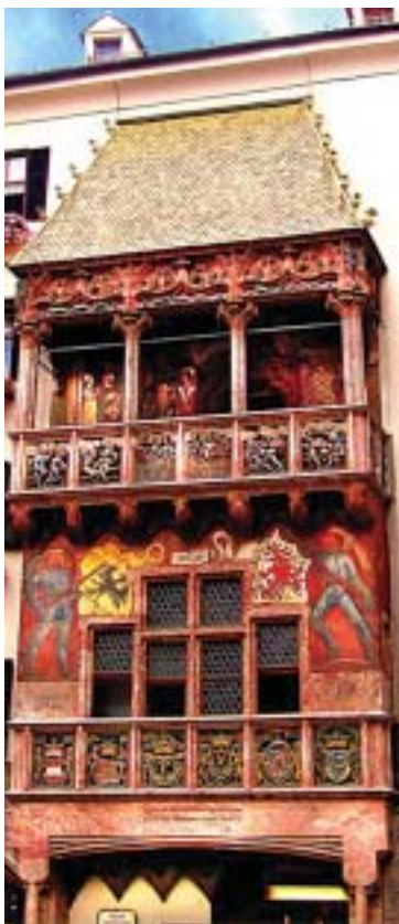
GOLDEN ROOF - INNSBRUCK

for your family. Enjoy a delicious hot buffet Indian and Chinese lunch. Today we have arranged a special 100% surprise for our valued guests. Truly one of the most memorable moments of your Europe tour. Continue on your scenic drive into Switzerland, as you arrive into Engelberg, situated amidst the majestic Swiss Alps. This location has been specially chosen for you to get a real feel of Switzerland. Tonight enjoy a lavish Indian dinner especially prepared for you by our own chef.