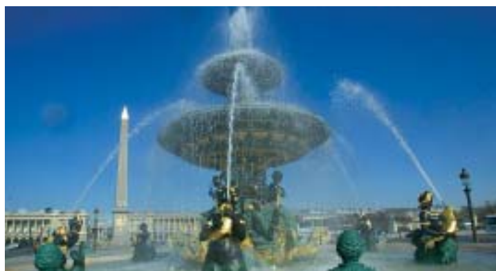
CONCORDE SQUARE - PARIS

Bien Venue! Welcome to the glamour capital of the world –