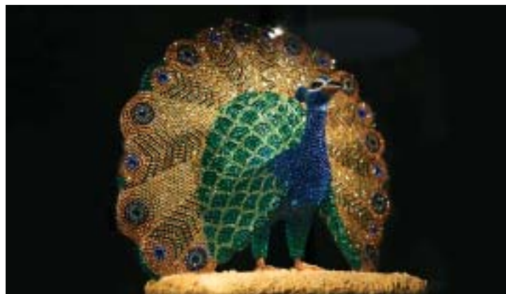
CRYSTAL PEACOCK EXHIBIT AT SWAROVSKI

Schweizerhof / Europe / Central in Engelberg or similar.