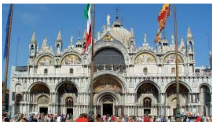
ST. MARKS BASILICA - VENICE

This astonishingly wonderful lagoon city is a special delight to visitors. Sail over the Guidecca Canal, as you catch a glimpse of the serene waters of the Adriatic Sea. On arrival, admire the St. Mark's square with the Basilica, the Doge's Palace, the Campanile and the Bridge of Sighs. You will be taken on an unforgettable Gondola ride through the smaller canals for a true picture of this lagoon city. Also visit the Murano Glass showroom. Today we have specially arranged a hot Indian lunch with some lively scintillating Italian music on board a private cruise for our valued guests. Return to the pier and continue on