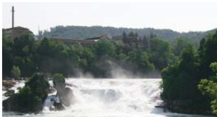
RHINE FALLS, SCHAFFHAUSEN