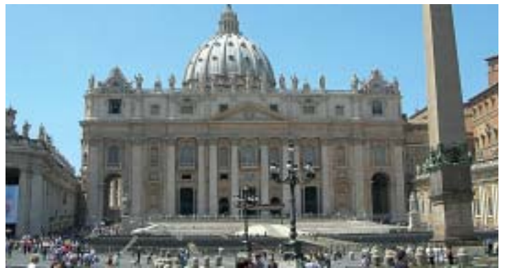
VATICAN CITY - ST. PETERS CATHEDRAL

year-old stone ruin. Also see the Victor Emmanuel Monument, the Roman Forum and many more sights of this historic city. Enjoy a hot Indian lunch before you commence your onward journey towards Florence. Later, check into your hotel and relax. Tonight, we have arranged