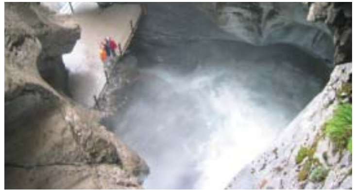
SPECTACULAR TRUMMELBACH FALLS

Palace on top of the longest glacier in the Alps. A visit to the Sphinx is also included. Today you have a choice of an Indian meal OR a local meal for lunch with champagne specially arranged for you at Jungfrauoch – one of the many great experiences on your tour! Later, we visit Interlaken,