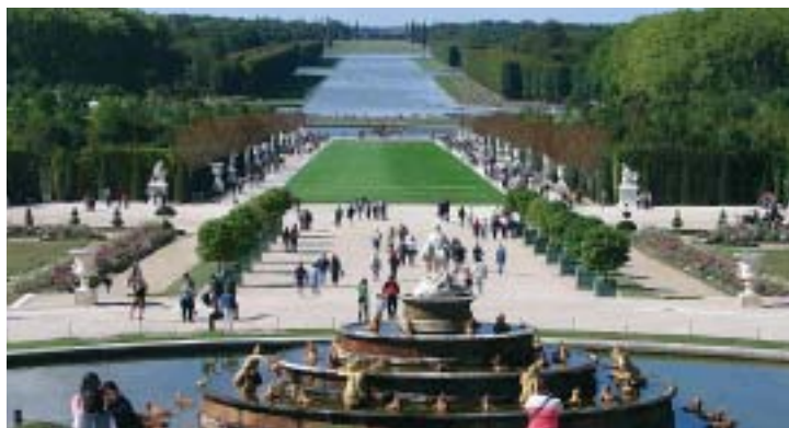
THE GARDENS OF VERSAILLES

Palace and its famous Gardens. Also, visit the world-renowned Louvre museum famous for its artifacts, paintings and sculptures.