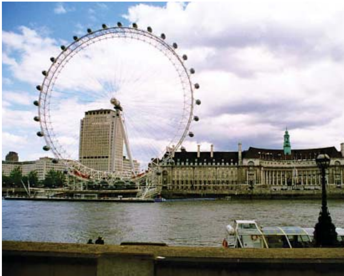
LONDON EYE - THE WORLD'S LARGEST OBSERVATION WHEEL

above the river Thames and a panorama of some of London's most famous streets, churches, palaces and monuments are spread out before you. Later, check into your hotel. Tonight enjoy a delicious Indian dinner.