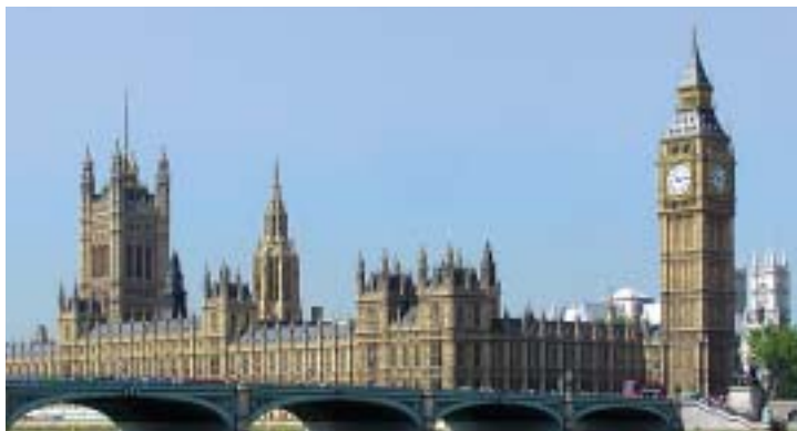
THE ELEGANT BIG BEN AND THE HOUSES OF PARLIAMENT - LONDON

After a buffet breakfast, we leave for a guided city tour with an expert English-speaking guide who will explain to you all the highlights of London's landmarks: the Changing of Guards at Buckingham Palace, Hyde Park, the Big Ben, Westminster