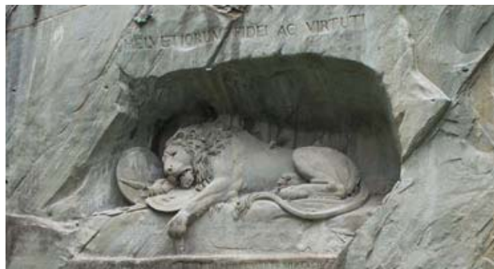
LION MONUMENT - LUCERNE

Later, enjoy a delicious Indian lunch. Next, we proceed to scenic Lucerne, where you will have an opportunity to visit the Lion Monument and the Kapell Brücke wooden bridge. Free time to shop for famous Swiss watches, knives and chocolates. Enjoy a scenic