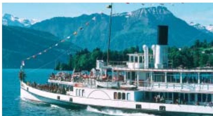
SCENIC CRUISE ON LAKE LUCERNE

cruise on the serene waters of Lake Lucerne. Tonight enjoy a delicious Indian dinner.