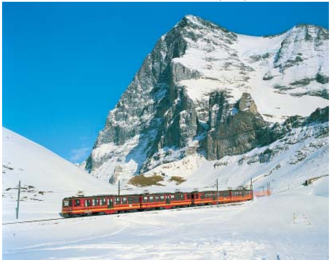
RIDE TO JUNGFRAUJOCH ABOARD A COG - WHEEL TRAIN