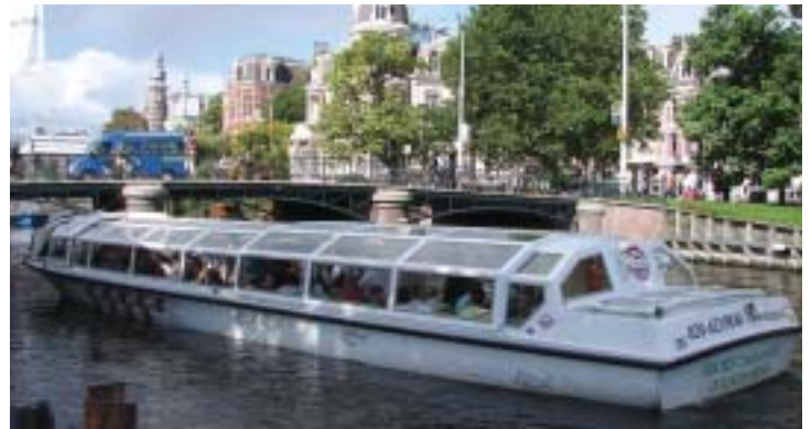
CANAL CRUISE IN AMSTERDAM

Keukenhof, the beautiful tulip gardens, till 18th May. From May 19th onwards, visit Volendam, an enchanting traditional town of Holland. Explore Amsterdam on an exciting canal cruise and later stop at the Dam Square- the real heart of Amsterdam.