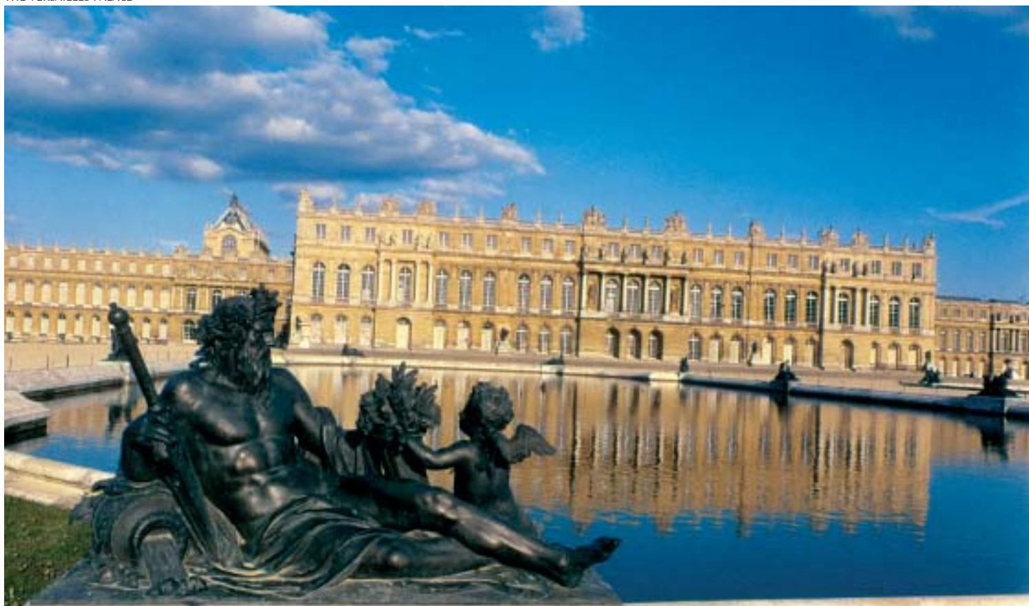
THE VERSAILLES PALACE