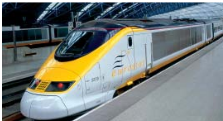
THE RIDE OF YOUR LIFE ABOARD THE EUROSTAR

aboard the ultra-modern Eurostar, one of the world's fastest trains. Zip into London in approximately 2 hours. Visit the world-renowned Madame Tussauds wax museum. Be amazed by the breathtaking views of the city as you ride the