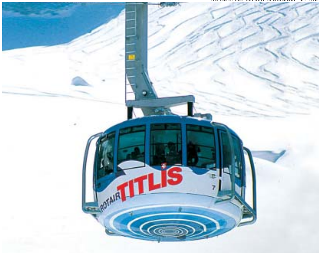
WORLD'S FIRST REVOLVING CABLECAR - MT TITLIS

After a buffet breakfast at your hotel, check out. Today, we take you on one of the most memorable experiences of your Europe tour – visiting Mt. Titlis and Lucerne. Adventure awaits you in a sensational cable-car ride up to Mt. Titlis. Marvel at the world's first revolving cable-car ride, a truly once-in-a-lifetime experience. Remain spellbound as you ascend the snow-clad mountains. Experience the snow and ice on top of Mt. Titlis, also a chance to ride, 'Ice Flyer'. At 3,020 meters a breathtaking panorama unfolds.