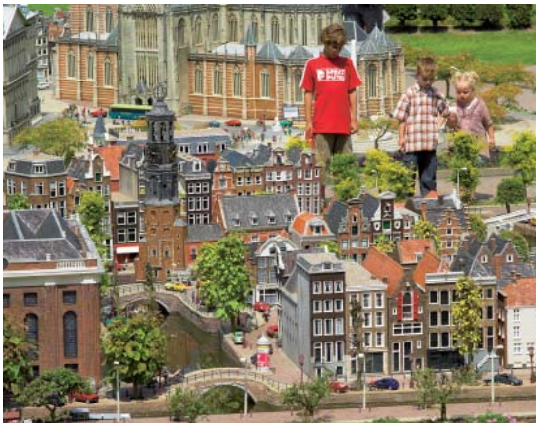
MADURODAM - HOLLAND IN MINIATURE

– the most common sight in Holland for a photograph. Later, visit the famous Dam Square – the real heart of Amsterdam, where the Royal Palace, the Nieuwe Kerk and the War Memorial overlooks this vast and bustling open space. Drive back to your hotel where a hot Indian dinner