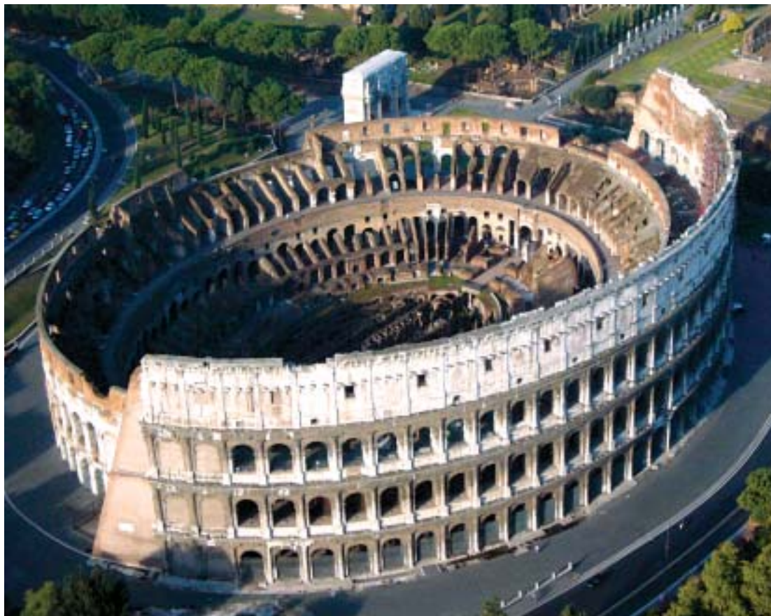
VISIT THE HISTORICAL COLOSSEUM FROM INSIDE