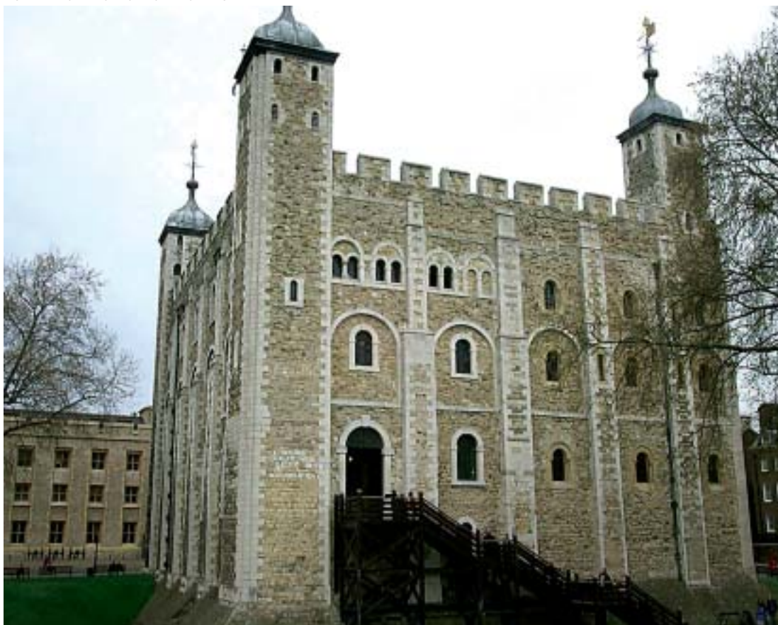
VISIT THE TOWER OF LONDON FROM INSIDE

missed. A treasure house of English history, the Tower of London houses the exquisite crown jewels including the Kohinoor diamond and many other British national treasures. Later, you have some free time to shop at many of London's famous shopping stores like Marks and