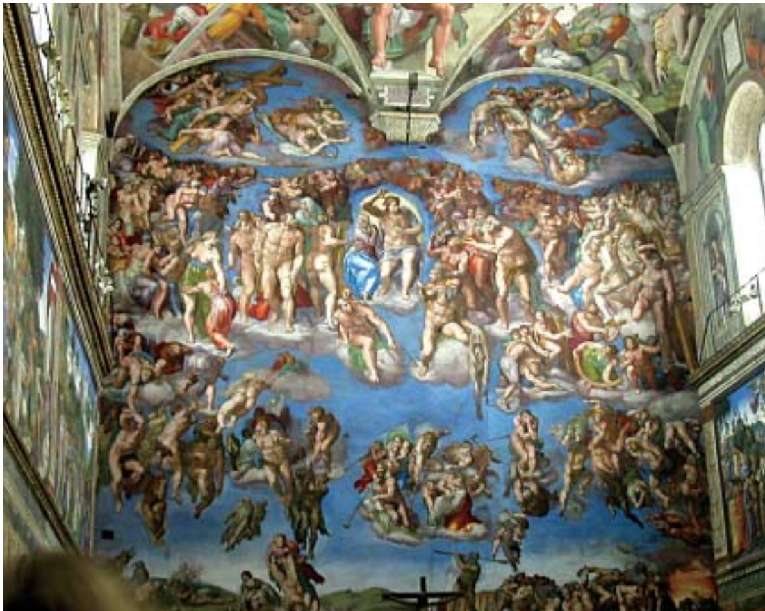
MICHELANGELO'S PAINTINGS IN THE SISTINE CHAPEL

a hot delicious Indian buffet dinner in the comforts of your hotel itself. Overnight at Wall Art/Holiday Inn Hotel or similar, in Prato/Pisa.