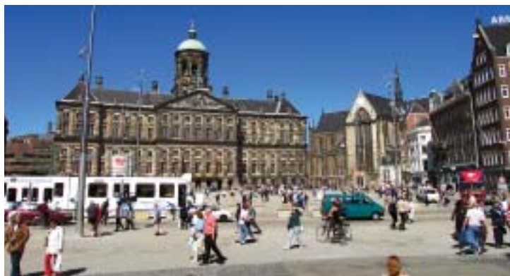
DAM SQUARE - THE HEART OF AMSTERDAM

out of wooden blocks. You also have a chance to savour some cheese. Next, visit Madurodam, all throughout the year, where you can see most of Holland in miniature, replicated in minute detail on a 1:25 scale. Next, arrive into Amsterdam. This afternoon, you have a choice to