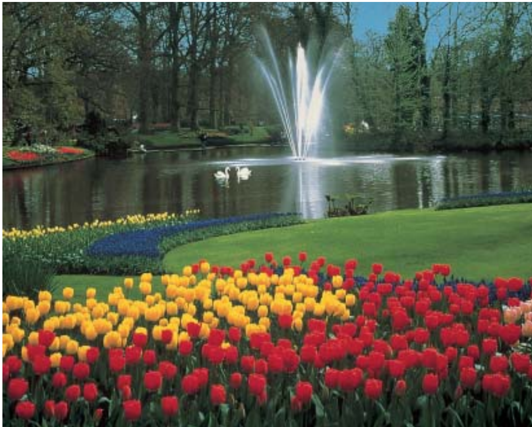
KEUKENHOF - TULIP GARDENS

After a buffet breakfast, sit back and relax in your coach as we proceed to Keukenhof – the largest spring garden in the world. Bulbs of colourful tulips bloom only till May 18th. Be enchanted by the indoor floral displays and colourful flower beds amongst ancient trees. 19th May onwards, visit Volendam. Marvel at the beauty of this picturesque town, its people in graceful traditional costumes, its little wooden houses and the quaint harbour will amaze your imagination. Visit a cheese farm and a wooden shoe factory. See a demonstration of how cheese is made and wooden shoes are carved