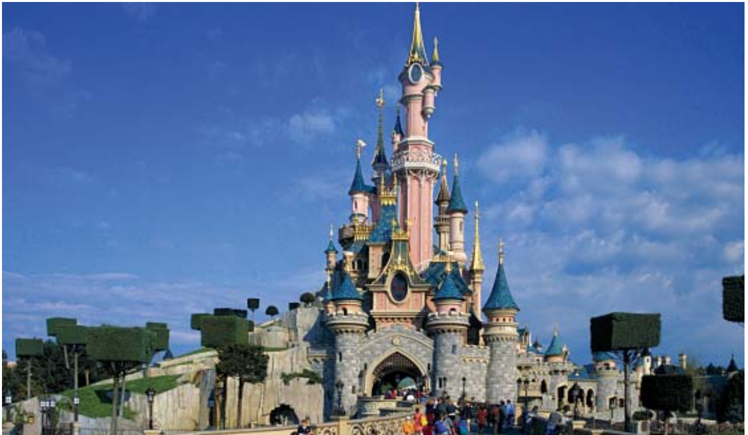
DISNEYLAND - PARIS