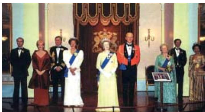
WAX STATUES AT MADAME TUSSAUD'S

including India's top leaders and film stars. Next, we take you on the famous London Eye – the world's largest observation wheel. Be enchanted by this new and novel way of seeing the city from a birds eye view, as the London Eye takes you on a 30 minute flight, rising to 450 feet