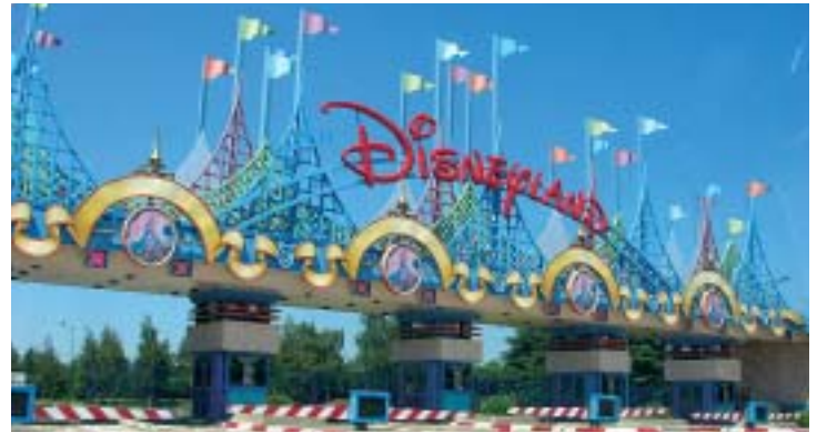
ENJOY THRILLS AT DISNEYLAND

Tours starting from Rome on Monday / Wednesday / Thursday / Friday / Saturday will visit Euro Disney only and Tours starting on Tuesday / Sunday will visit the Versailles palace and gardens and the Louvre museum only.