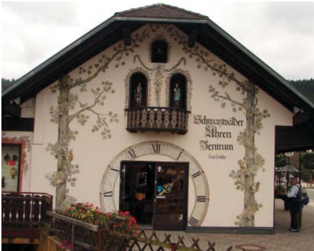
DRUBBA: HOME OF THE CUCKOO CLOCKS

Overnight at the Ramada, in Weisbaden or similar.