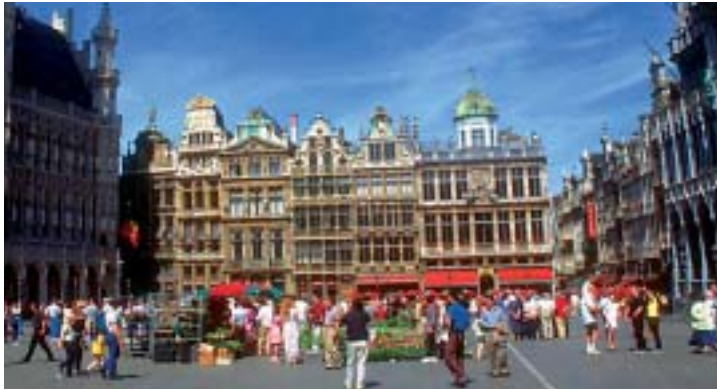
GRAND PLACE - BRUSSELS

drive to Cologne. Visit the impressive Cologne Cathedral, a fine example of amazing Gothic architecture. Today, enjoy a hot Indian lunch. Next, proceed to Brussels to visit the world renowned Grand Place and the legendary Mannekin Pis statue. Drive