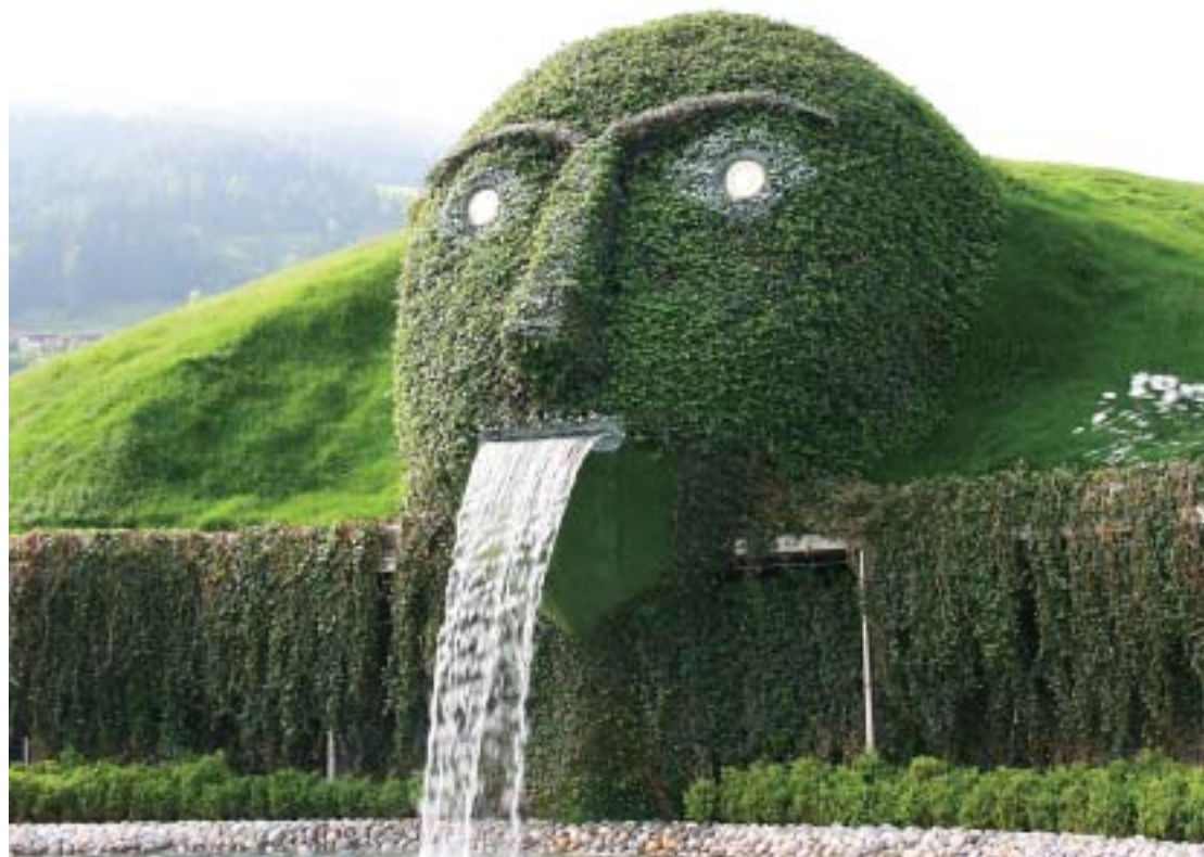
THE WATER-SPOUTING GIANT WATCHING OVER THE SWAROVSKI KRISTALLWELTEN

This morning, after a buffet breakfast, you are ready to proceed to Wattens, where you will visit the world-famous Swarovski Crystal Museum. Enjoy a fascinating experience into the 'world of crystals'. An experience that leaves you amazed at the dazzling glitter as you walk through this museum. A great opportunity to buy a souvenir