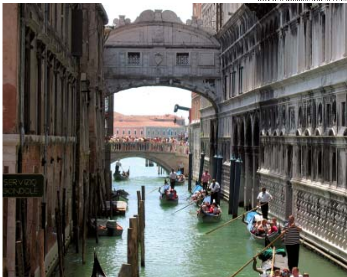
ROMANTIC GONDOLA RIDE IN VENICE

Due to the European Football Championship some groups may not stay in Innsbruck.