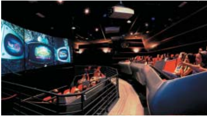
TIME ELEVATOR - ROME

check out of your hotel, board your deluxe air-conditioned coach and proceed with an expert English-speaking guide to the Vatican City – the smallest state in the world (shorts or sleeveless vests not allowed).