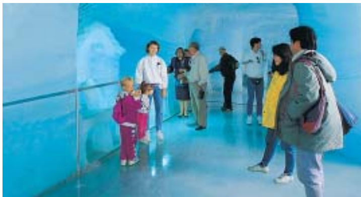
ICE PALACE - JUNGFRAUJOCH

Truly an unforgettable experience. Next, get ready for an adventurous ride to visit Jungfrauoch – the Top of Europe, for a memorable encounter with snow and ice – a genuine 'high-point' of your tour! Sit back in your coach as we proceed to the beautiful town of 'Lauterbrunnen', where the excitement continues. You will be amazed at the scenic splendour that you see from aboard the 'cog-wheel' train, which takes you to a height of 3,454 meters to reach Jungfrauoch! This is a trip to another world – a wonderful world of eternal ice and snow. Experience the magic of the mountains and visit the Ice