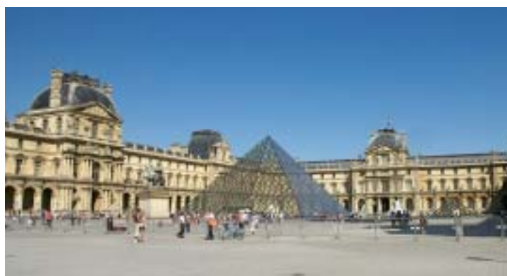
VISIT THE RENOWNED LOUVRE MUSEUM

Overnight at hotel Novotel Est/Novotel La Defense/Mercure Porte de