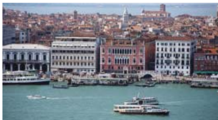
ENCHANTING CITY OF VENICE

your journey towards picturesque Austria. You will be entranced at the scenic beauty, as you ascend over the Brenner Pass into Innsbruck – the capital of Tyrol. See the Golden Roof and the Maria Theresien Strasse. Stroll on cobbled stone pathways and get a feel of old-world European charm.